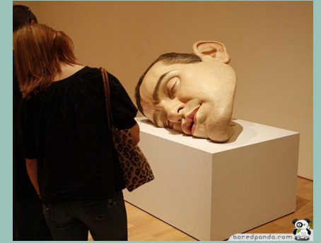
Ron Mueck, 2013