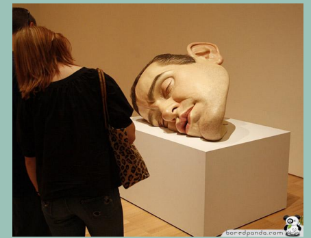
Ron Mueck, 2013