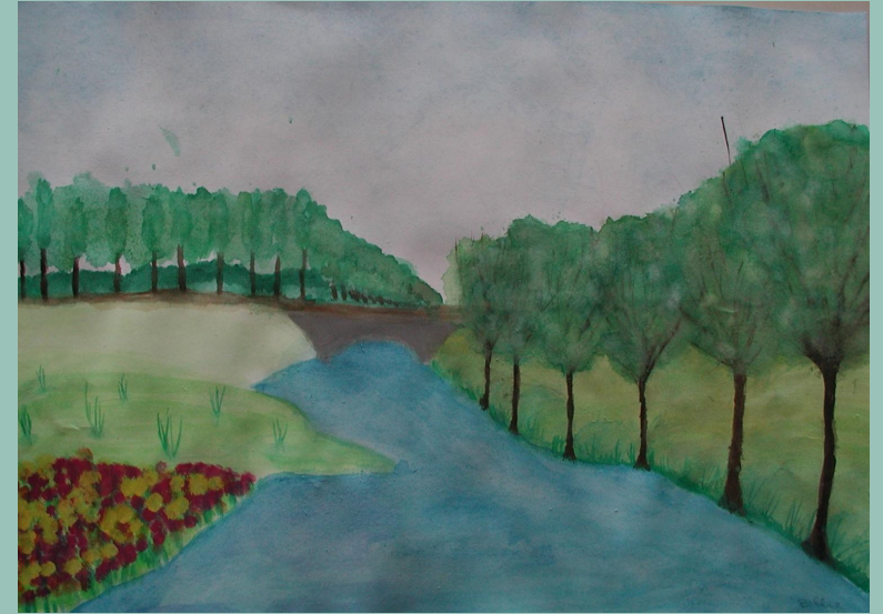
Chinese versus European Landscape traditions