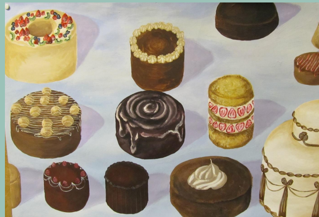
Naturalism versus Abstraction