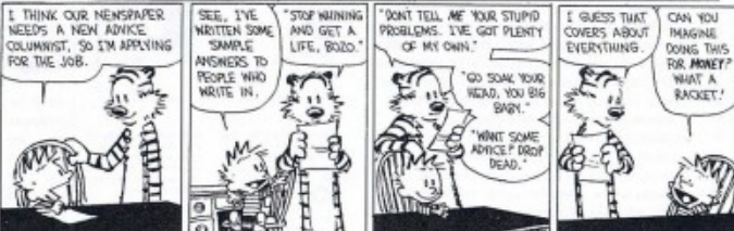
CALVIN AND HOBBES © Watterson. Reprinted with Permission of UNIVERSAL PRESS SYNDICATE. All rights reserved.

A: He'd be shocked....and then he'd love them!