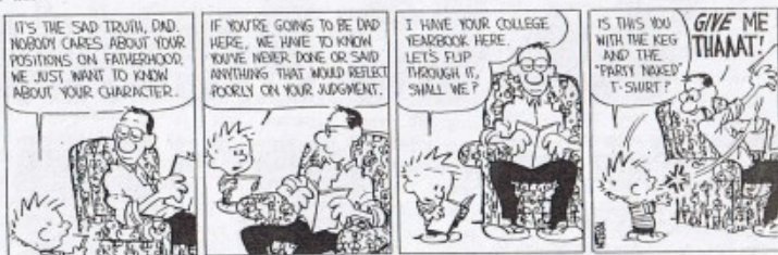
CALVIN AND HOBBS © Watterson. Reprinted with permission of UNIVERSAL PRESS SYNDICATE. All rights reserved.